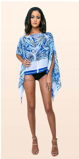
Boat Neck ●