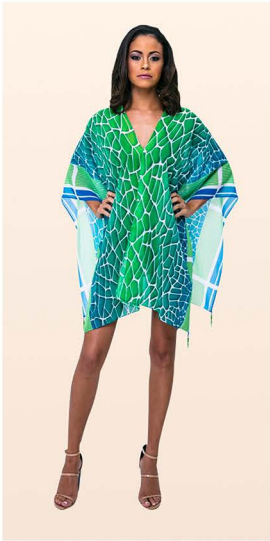
Front View ●