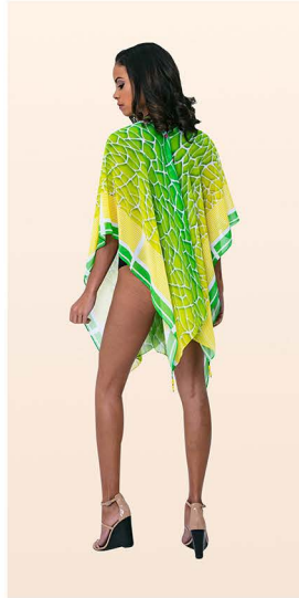
Back View ●