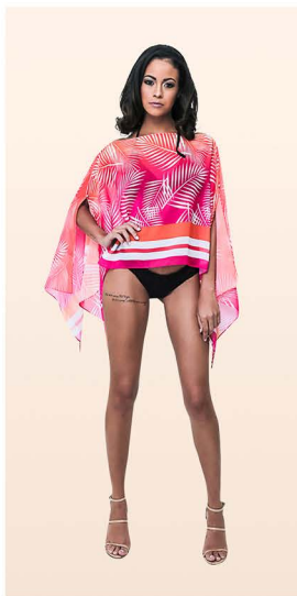
Boat Neck •