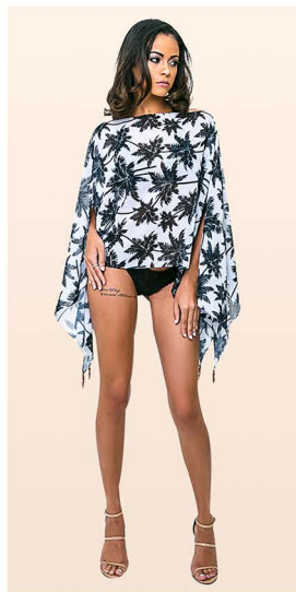
Boat Neck •