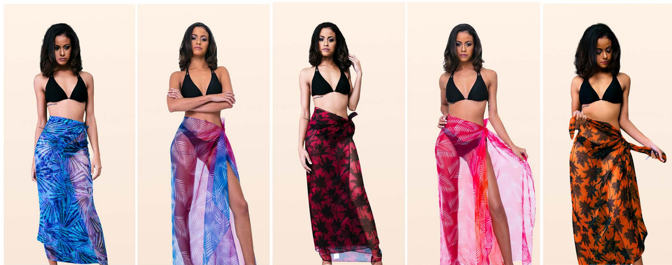
Locally designed beach wraps